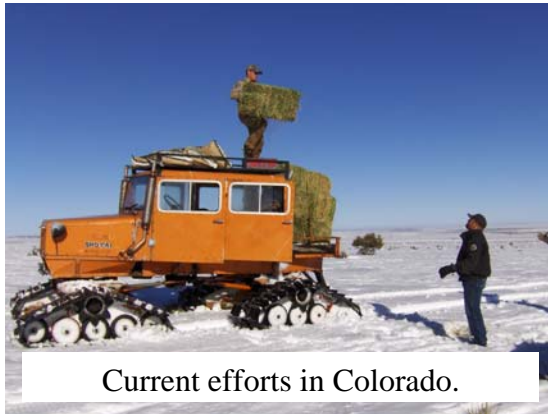
Current efforts in Colorado.