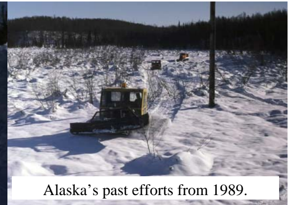
Alaska's past efforts from 1989.